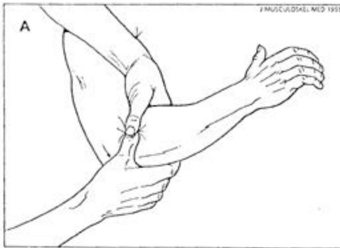
Figure 1 - A variety of disorders are included under the umbrella designation of overuse syndromes, including carpal tunnel syndrome (CTS) (inset), medial and lateral epicondylitis (A), and tendinitis of the wrist (B). Repetitive overuse is the underlying mechanism of injury; in some instances – as appears to occur in patients with CTS – this may be related to the person’s occupation. None of these problems involves actual inflammation; instead, histologic studies show disorganized collagen and pale, haphazardly arranged mesenchymal cells. Management is aimed at controlling pain as well as stretching and strengthening the involved tissues to reduce adhesion formation and promote function.