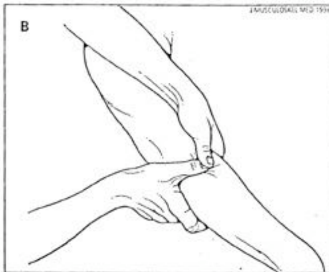
Figure 2 - In this illustration of active release therapy, the therapist is working on the extensor carpi radialis longus and brevis muscles by applying pressure to the muscles distal to their attachment at the elbow. The patient starts with the elbow bent and wrist straight (A). As the therapist holds the muscles, the patient extends the elbow and pronates and flexes the wrist while the therapist moves the pressure proximally (B), attempting to release adhesions around and between muscle planes. The patient can subsequently perform similar maneuvers at home.