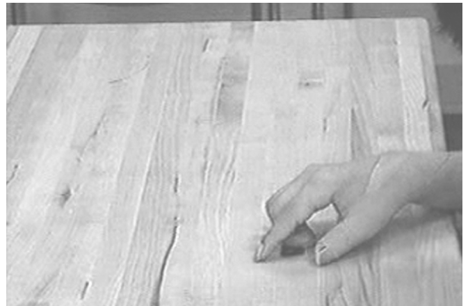
Figure 2. After taping—grasp of pellet-item 7 of Melbourne Assessment.